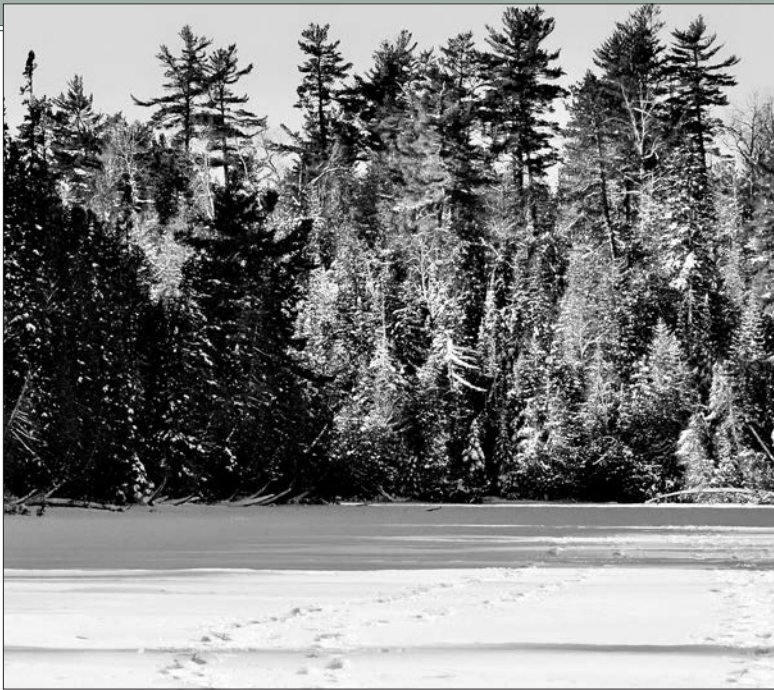
Winter in the BWCAW.