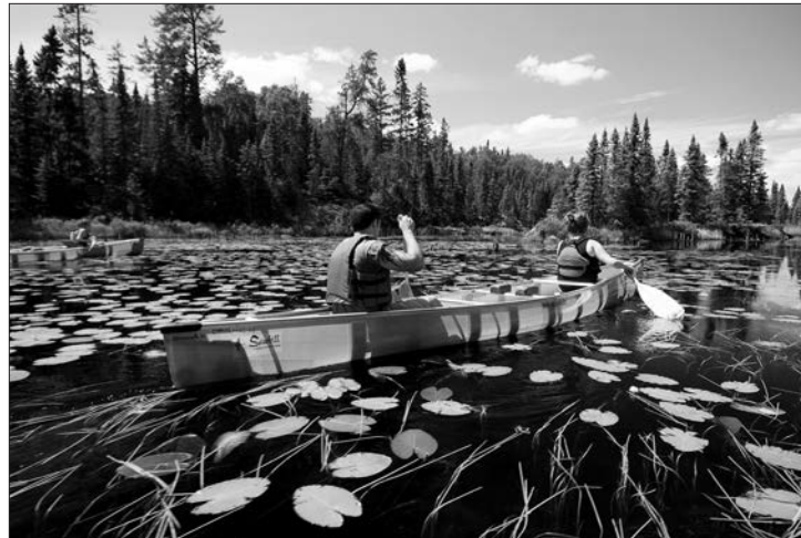
Kelso River off Sawbill Lake, BWCAW.

To read about the kick-off to our climate campaign, visit http://bit.ly/ClimateKickoff