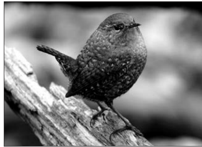
Winter Wren

Perhaps you met the Winter Wren the way I did - roused early from my sleeping bag deep within the Boundary Waters Wilderness. While everyone else snored on, I was lured into the woods, searching for a glimpse of whatever was capable of making that sound. Cornell's Lab of