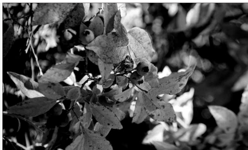
BVCAW Blueberries.